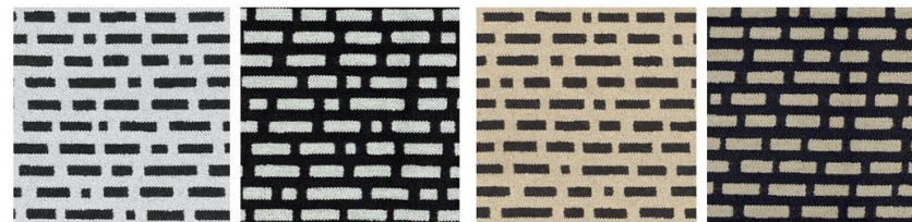
JOLIE 20 / 015